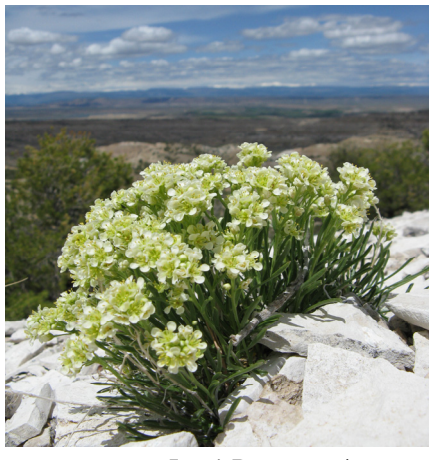
Jessi Brunson / USFWS